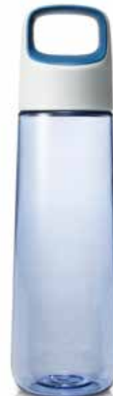
Clear Water #2764