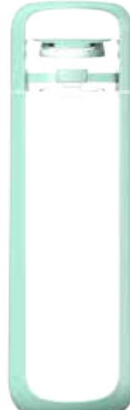
Sea Spray #15006