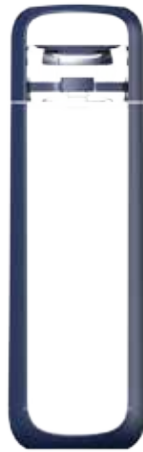
Dark Denim #15004