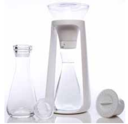
Complete Set Includes: Water Fall stand, 2 carafes with lids, 1 filter

*Water Fall currently seeking NSF certification. Internal tests show filter to meet NSF 42 standards for removal of chlorine, taste and odor and chloramines for up to 80 gallons.