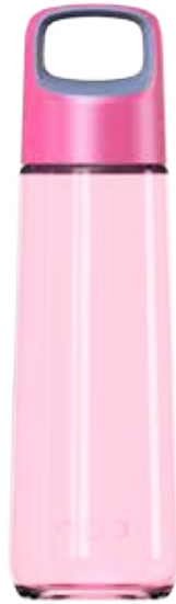
Illusion Blue #19012