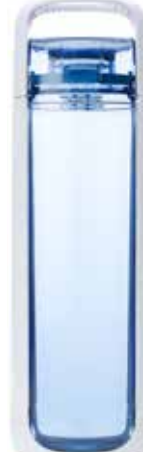
Clear Water #7420