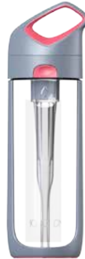
Illusion Blue #17012