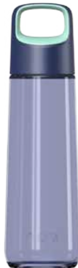
Aqua Splash #19011