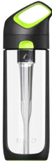
Blazing Yellow #17019