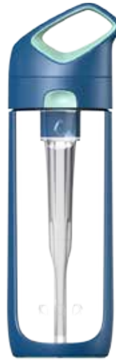
Aqua Splash #17011